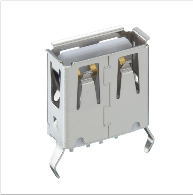
USB 2.0 chassis socket type A, upright version, for printed circuit boards