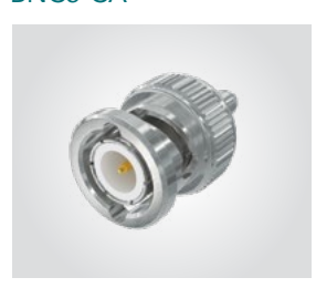
Supplied with pins, washers, nuts, gaskets and ferrules.